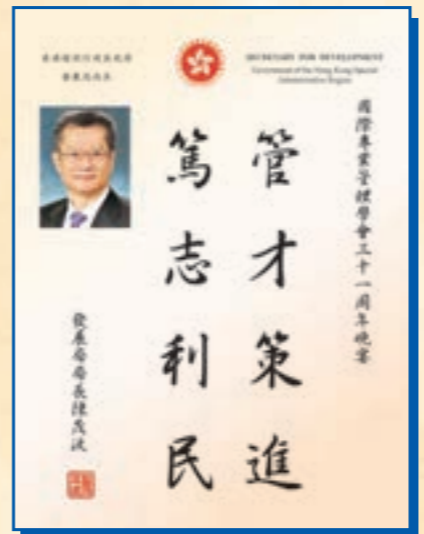
國際專業管理學會三十一周年誌慶