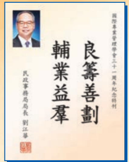
國際專業管理學會三十一周年誌慶