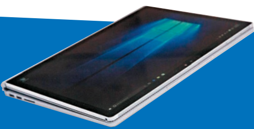
■ Surface Book 支援觸控筆。網上圖片